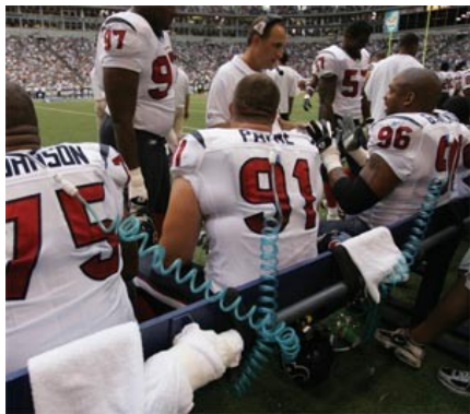
NFL players use air-cooled shoulder pads to reduce the risk of heat related illness.

Features & Benefits 1. Reliable break away design • Rapid automatic disconnection • Easy hands-free operation • Dependable for multiple disconnections 2. Automatic dual shutoff valves • Avoid leaks and spills • Reduce clean-up time • Safe and clean fluid handling